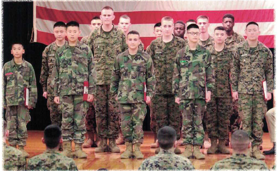
New NHS and NJHS inductees during the Academic Awards Ceremony Feb. 1