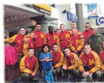
MMA's Rotary Interact Club members always ready to lend a helping hand!

The trip is part of the Make-A-Wish Foundation's work with children battling severe illnesses.