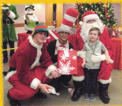
Children from neighborhoods near MMA enjoyed time with Santa Claus during the yearly Christmas party.