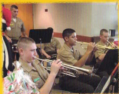
Members of MMA's Leatherneck Band keep the mood lively during the annual Marine Military Academy Christmas Party.

After dinner, children lined up to visit with Santa Claus. The little ones left with a gift, a candy bag and a big smile on their faces.