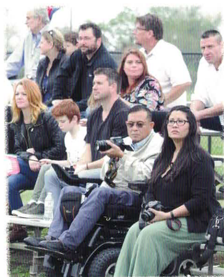
Parents and family members wait for the start of the Mid-Term Introduction Training Graduation Parade.

The new cadets later joined their families for their first weekend of leave.