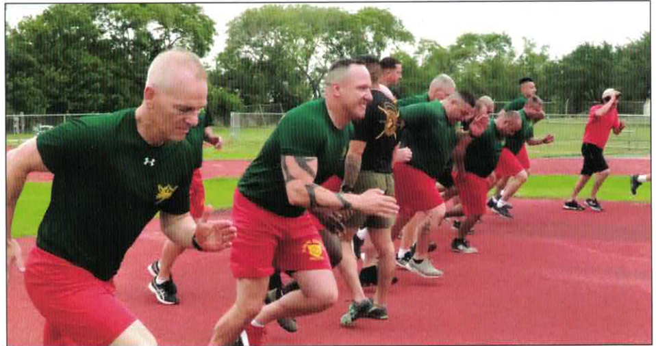
Marine Military Academy drill instructors, assistant drill instructors and other personnel learned the new physical training program instituted by the U.S. Marine Corps.

Marine Military Academy's staff recently underwent training on the new physical training program instituted by the U.S. Marine Corps.