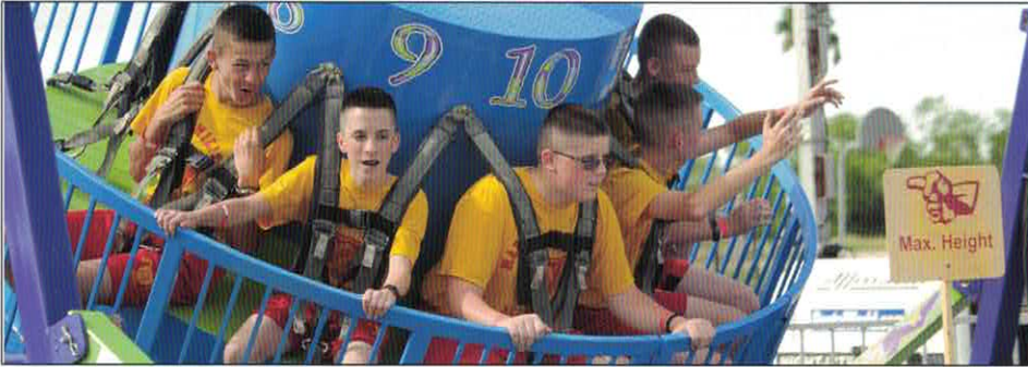
MMA cadets enjoy the rides during the 2019 Spring Fling.