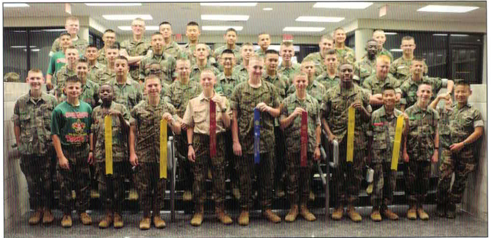
MMA's BSA Troop 22 participated in the annual Camp Perry Camporee recently.

The project took four weeks to complete.