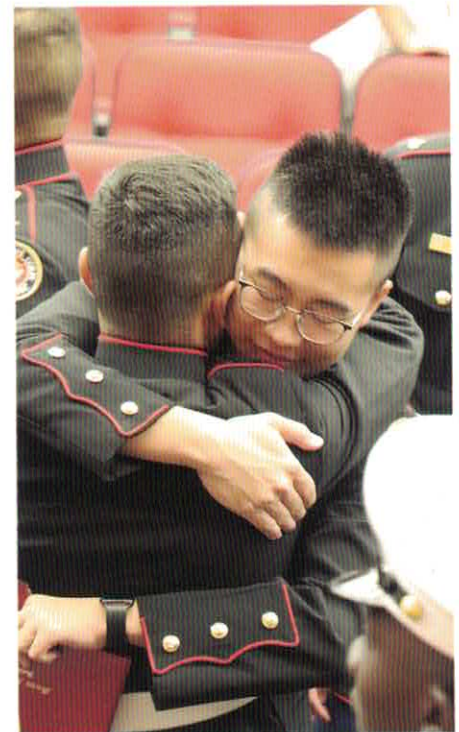
MMA grads leave the school knowing they are part of a unique brotherhood.

The ceremony concluded with the traditional tossing of the covers (hats) by the senior class. Parents and family members from across the country and around the world were present for the event.