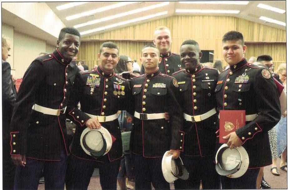
Marine Military Academy Class of 2019 members were all smiles after their graduation ceremony.